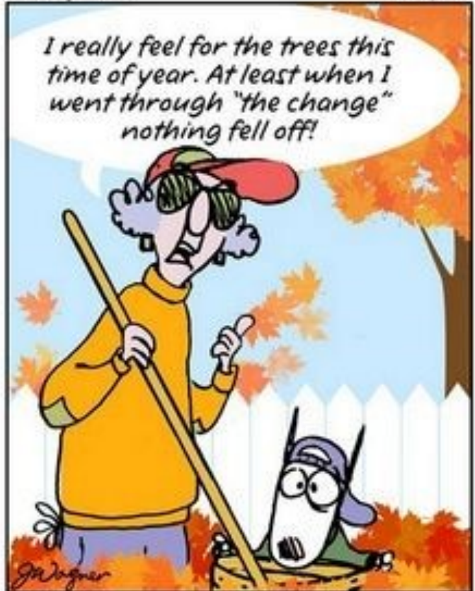
Crabby Road 11-9-11